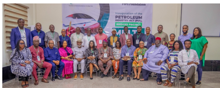
Inauguration of The Bridges Project Multistakeholder Platform in Port Harcourt, Rivers State, on August 11, 2023

The Multistakeholder Platform (MSP), which represents all stakeholders, commenced in August 2023. The NUPRC is being updated on the progress of the MSP deliberations on critical issues relating to the implementation of the PIA.