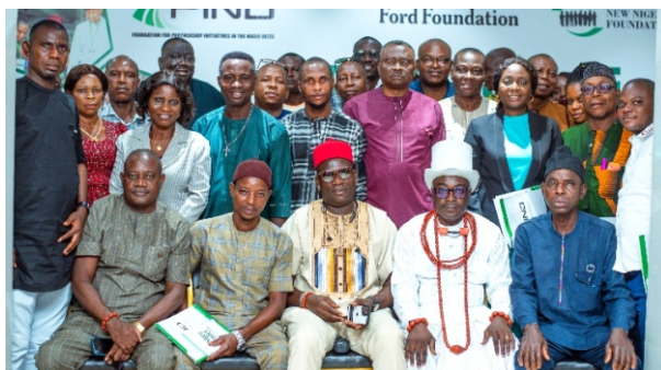
A group of participants at The Bridges Project Awareness Creation Workshop in Asaba, Delta State

This component involved deepening knowledge of the PIA technical components among community stakeholders. The sensitization sessions were facilitated in the five focal states between June and July 2023. Relevant and critical community stakeholders convened for pragmatic learning, discussions, and understanding of the expected roles and responsibilities of individual and collective actors under the PIA dispensation. HCDDT members and other stakeholders in these states acquired essential knowledge and skills regarding the core components and implementation requirements of the PIA, enhancing their ability to ensure compliance. Over 500 participants attended the sessions. Some outcomes of the sessions included: