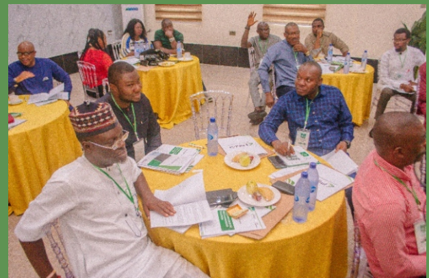
A cross-section of participants.