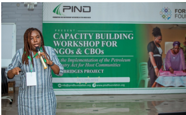
A trainer at The Bridges Project Capacity Building Workshop in Warri, Delta State, which was held from March 21 to 23, 2023

Two capacity-building workshops were held in Warri, Delta State, and Port Harcourt, Rivers State, in March and April 2023. Fifty-four participants from 27 CSOs (including two representing people with disabilities) received training in the technical aspects of the PIA, which included: