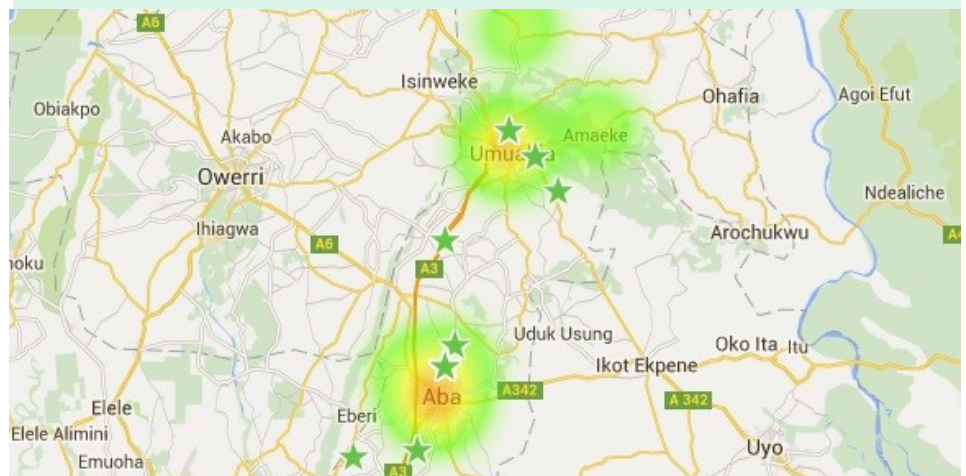
Figure 3: Heatmap of Incidents and Peace Agents in Abia State

Heatmap shows concentration of incidents reported from Feb – Apr 2016 in Abia State; with green stars representing the registered Peace Agents.