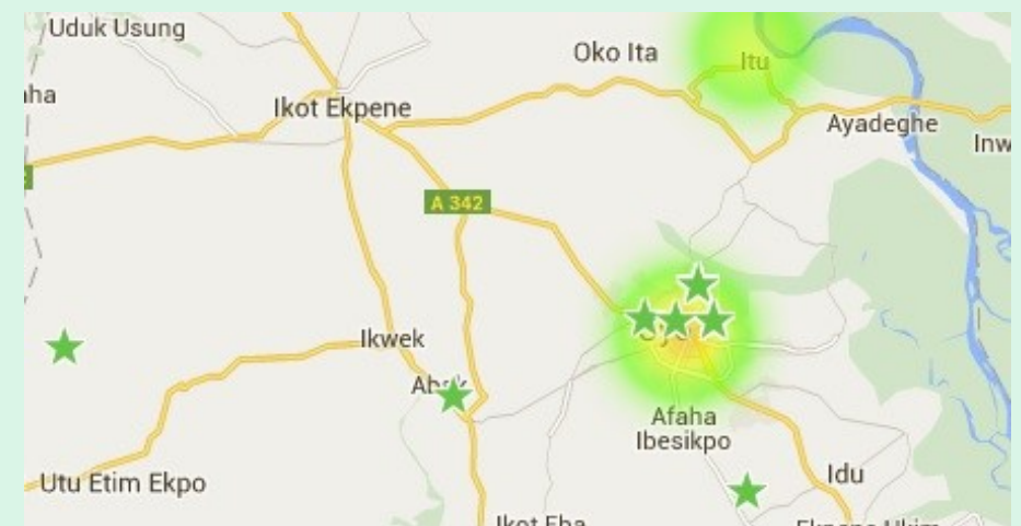
Figure 3: Heatmap of Incidents and Peace Agents in Akwa Ibom State

Heatmap shows concentration of incidents reported from Nov 2015-Jan 2016 in Akwa Ibom; with green stars representing the registered Peace Agents.