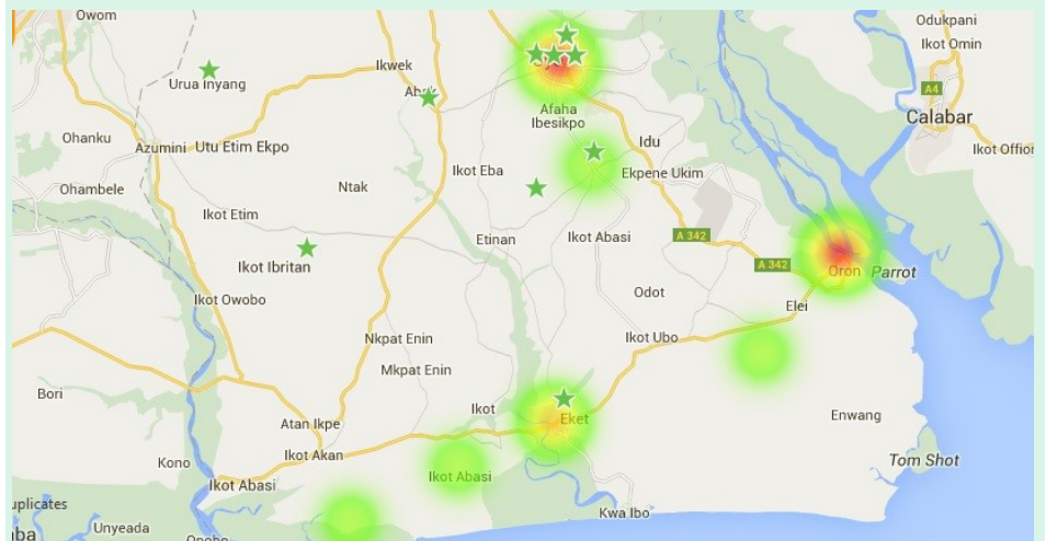
Figure 3: Heatmap of Incidents and Peace Agents in Akwa Ibom State

Heatmap shows concentration of incidents reported from Feb-Apr 2016 in Akwa Ibom; with green stars representing the registered Peace Agents.