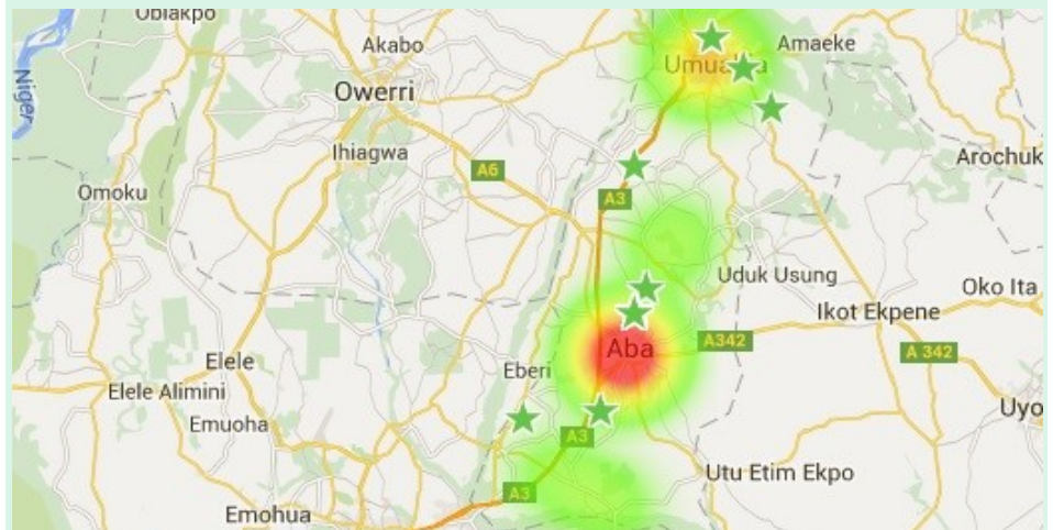
Figure 3: Heatmap of Incidents and Peace Agents in Abia State

Heatmap shows concentration of incidents reported from Dec 2015 –Feb 2016 in Abia State; with green stars representing the registered Peace Agents.