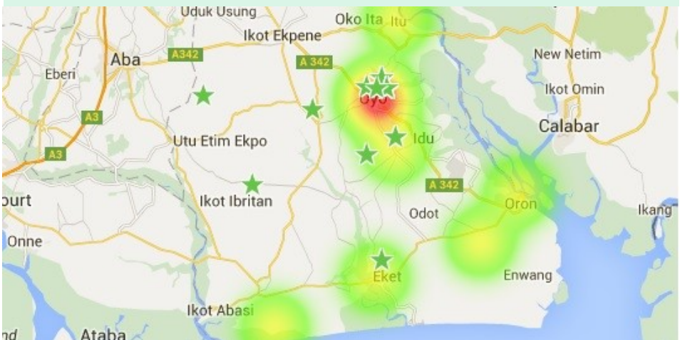
Figure 3: Heatmap of Incidents and Peace Agents in Akwa Ibom State

Heatmap shows concentration of incidents reported from Dec 2015 –Feb 2016 in Akwa Ibom; with green stars representing the registered Peace Agents.